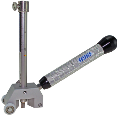
Fig. Model 318 C with chucking adapter and handle

The three nylon wheels provide the corresponding stability for the vertical placement and guidance.