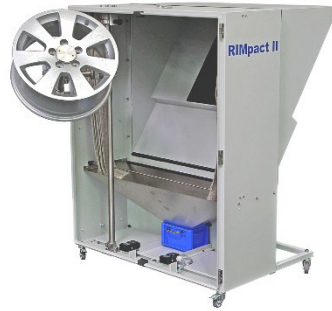
RIMpact II-VDA Impact cabinet (for Mod. 508 VDA)