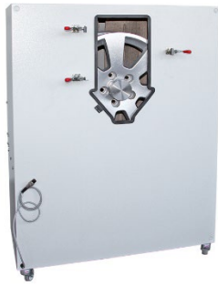
RIMpact I – Impact cabinet (for Mod. 508 SAE or VDA)