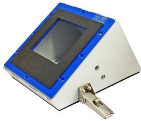
Attachment for tests in accordance with PSA D24 1312 (for Mod. 508 VDA)