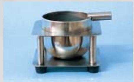
Electrolyte cup for measuring wires and small parts

GalvanoTest is a microprocessor based instrument with interactive LCD. It is suitable for measuring a variety of plating applications. The measuring application can be entered via touch-pad and visualized on a large alphanumeric display. Various data