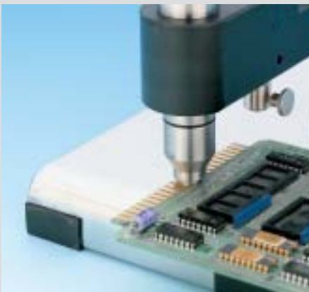
Typical measuring set-up: Measurement of gold layers on PCBs

The coulometric or anodic de-plating technique is used for measuring the thickness of electroplated coatings on virtually all substrates such as steel, non-ferrous metals or insulating material bases. Typical applications include: nickel on steel, zinc on steel, tin on copper, silver on copper or copper on epoxy.