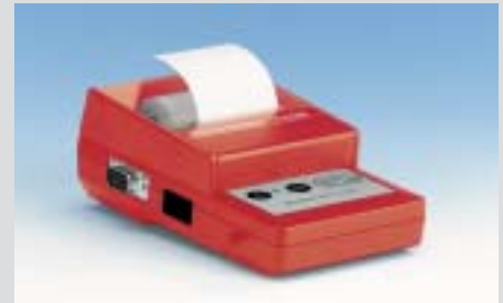
MiniPrint – data printer for immediate print-out of readings, statistics and measuring cell voltage curve

ports are available to connect GalvanoTest to peripheral units such as a PC, printer or Y-T recorder.