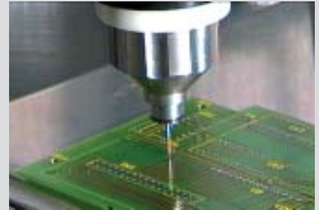
Centering unit for pinpoint cell positioning on small areas

Based on the principle of Faraday's law, GalvanoTest performs the electrolytic dissolution of a precisely delimited area of the sample. A measuring cell is filled with an electrolyte specially adapted to the