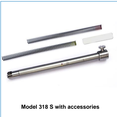
Model 318 S with accessories