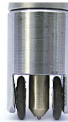
Fig. Rolling test head, Model 318 S

The head is equipped with two little rubber hooped guide wheels. This ensures that even if the user exerts unindentedly too much pressure onto the test pencil, only the test tip used will still leave a trace on the test surface.