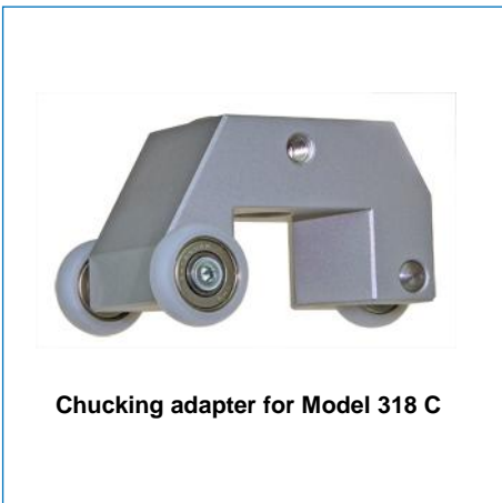
Chucking adapter for Model 318 C

testing equipment for quality management