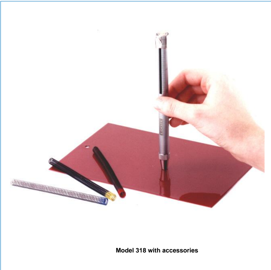
Model 318 with accessories