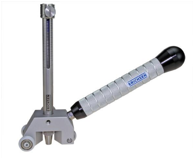
Fig. Model 318 C with chucking adapter and handle

The three nylon wheels provide the corresponding stability for the vertical placement and guidance.