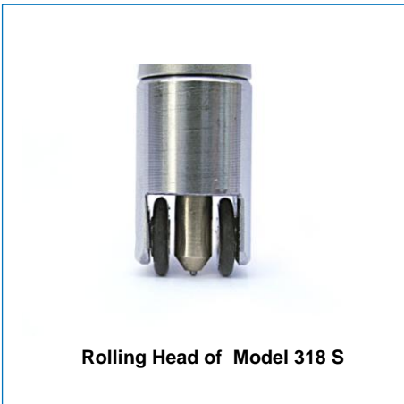
Rolling Head of Model 318 S